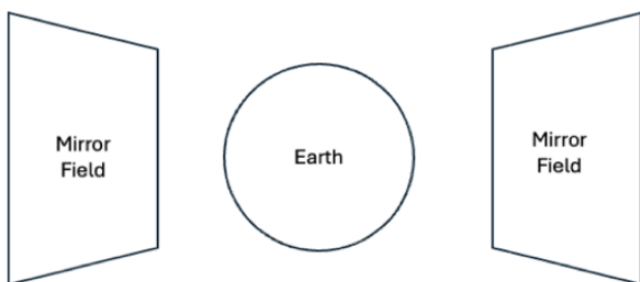
Figure 1. Mirror Gravitational Field