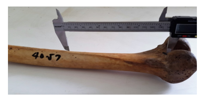
Fig.5. Measurement of Segment-4

4.Segment-4(d-e) (fig-5): from point 'd' to the most proximal point on the intercondylar fossa (e).