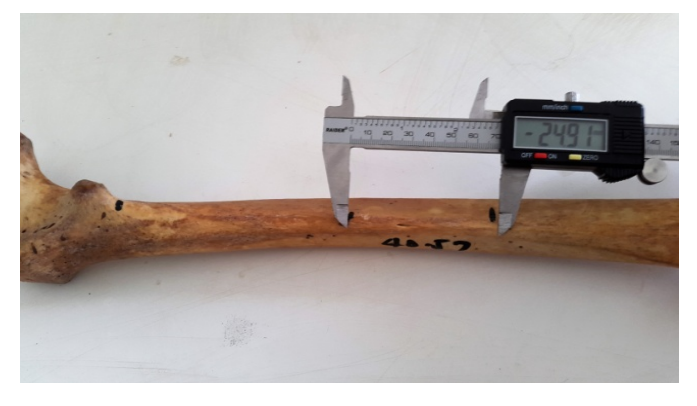
Fig. 4. Measurement of Segment-3

3. Segment-3(c-d) (fig-4): from point c to the point where the linea aspera form the lateral and medial supracondylar lines (d).