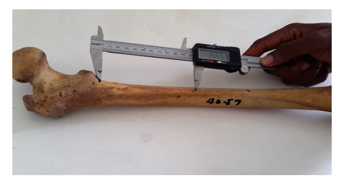
Fig.3. Measurement of Segment-2

2.Segment-2(b-c) (fig-3): from the lower border of lesser trochanter (b) to the point where the gluteal line and the spiral line joins to form the linea aspera(c).