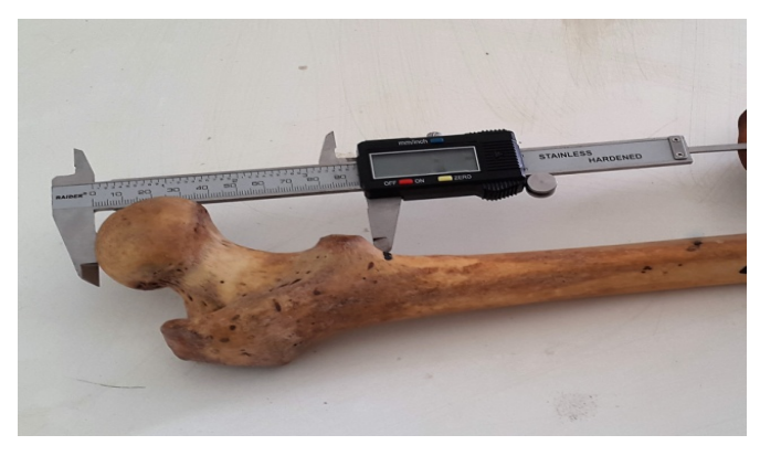
Fig. 2. Measurement of Segment-1

1.Segment-1(a-b)(fig-2): from the most proximal point (a) to the lowest border of the lesser trochanter (b) as shown below.