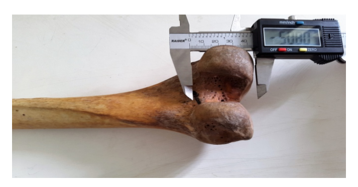
Fig. 6. Measurement of Segment-5

5.Segment-5 (e-f) (fig-6): from the most proximal point of the intercondylar fossa (e) to the most distal point of the medial epicondyle (f).