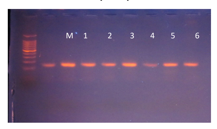
Figure 2. Agarose gel electrophoresis (2%) was performed on the PCR products of the aprA gene (152 bp), Line M has a DNA marker called 100 bp-2000 bp ladder,

This study replicated the findings of Wolska and Szweda (2009), which demonstrated that 84.6% of the P. aeruginosa bacteria that were isolated contained the last gene. The results align with the research carried out by Shi et al. (2012), which demonstrated that 80% of P. aeruginosa bacteria harbor the last gene. Furthermore, Sabharwal et al. (2014) discovered that 75% of the P. aeruginosa isolates examined in their study possessed this particular gene. The findings indicated that a significant fraction of clinical samples included the definitive gene, which is accountable for producing Elastase. This enzyme plays a crucial role in the pathogenicity of P. aeruginosa by degrading the Elastin protein (Cathcart et al. , 2011). This protein is crucial for preserving the flexibility of human blood arteries. Elastin is an essential component of the